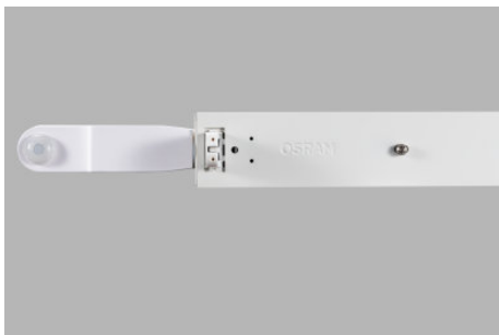
AirZing 5040 Product