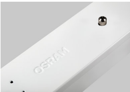
AirZing 5040 Product