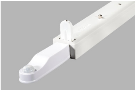
AirZing 5040 Product