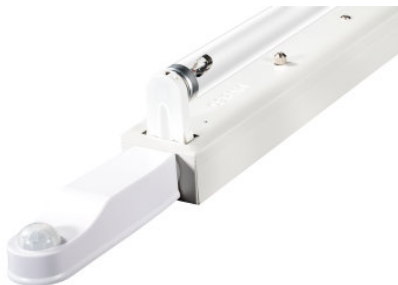
AirZing 5040 Product