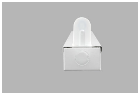
AirZing 5040 Product