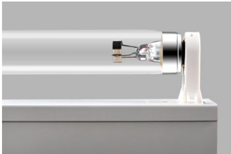
AirZing 5040 Product

PURITEC germicidal lamps emit high-intensity UV radiation that can cause sunburn and conjunctivitis. The skin and eyes must therefore not be exposed to direct or reflected unfiltered radiation.