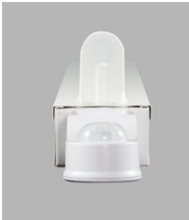
AirZing 5040 Product