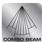
Combo Beam Combined beam of light