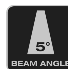
Beam angle 5° Exceptionally focused beam angle